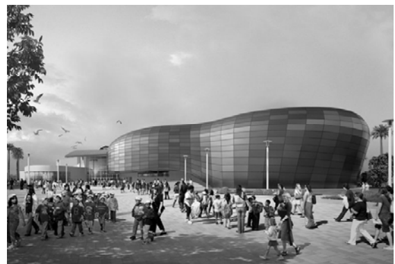
The Aquarium of the Pacific: Pacific Visions Wing

The world-class Long Beach Aquarium of the Pacific, on Rainbow Harbor, is located across the water from the Convention Center, Shoreline Village and the historic Queen Mary. The Aquarium is the fourth most-attended aquarium in the nation and it is home to over 11,000 marine animals in over 50 exhibits. Each year more than 1.7 million people visit the Aquarium for its world-class animal exhibits, hands-on activities and lectures by leading scientists. This past year, the Aquarium completed the steel beam structure for the Pacific Visions wing, the first major expansion to the facility since its opening. The expansion will include a state-of-the-art interactive theater, a larger changing exhibit gallery with live animals and an art gallery. When the Pacific Visions expansion is complete, the Aquarium will have the capacity to serve 2 million visitors annually.