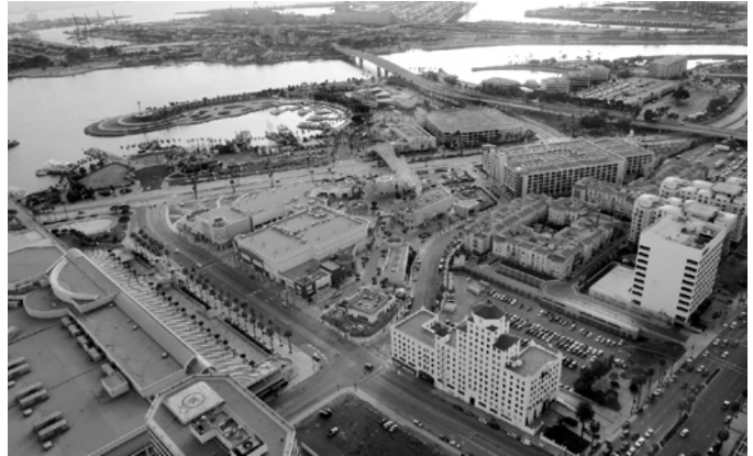
Downtown Long Beach overlooking the Port.

Currently, the largest employer within the City is the Long Beach Unified School District, which operates 84 regular, one continuation and two charter schools. The District's workforce ensures the success of students by maintaining high standards, a commitment to excellence and by offering a comprehensive scholastic program.