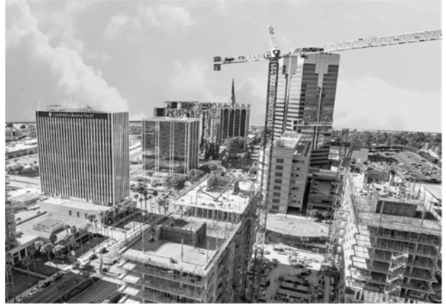
Development of the Long Beach Civic Center in Downtown Long Beach.

The City of Long Beach supports large and small industries through a holistic approach to economic development. All employees, regardless of their position descriptions, are, at their core, economic development ambassadors and are expected to provide excellent customer service. This provides the foundation for a strong, welcoming, and well-run city. In addition, the City supports targeted programs that impact businesses. These programs include workforce development services provided by Pacific Gateway, a City-operated non-profit organization; business improvement districts; streamlined permitting, inspection, and licensing services; low costs business license tax structure; and direct financial assistance through several loan and rebate programs.