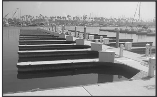
A previously completed phase of the Alamitos Bay Marina Rebuild project is shown above. The construction project's general contractor is Bellingham Marine, a leading builder of marinas, with projects both in the United States and throughout the world.

The next round of docks to be filled will be thirteen (13) and fourteen (14), which will accommodate boaters with thirty-five foot (35') slips.