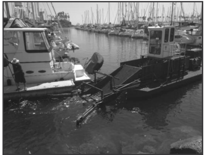
The Marine Bureau's "Marauder" watercraft, at work within Shoreline Marina, following early storms in September 2015.

With forecasts predicting the potential for a heavy "El Nino" rainy season ahead of us, the Beach Maintenance team has plans for expanding its boom collection system at the foot of the L.A. River, coupled with recently refurbished conveyer equipment to aide in quickly removing entrapped debris from the waterways. "We've developed a good plan for the upcoming months" commented Armstrong, "and we expect to prevent a lot of trash from reaching the shores of Long Beach.