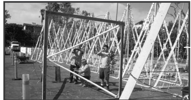
Staff prepare trees for the annual lighting at the bay