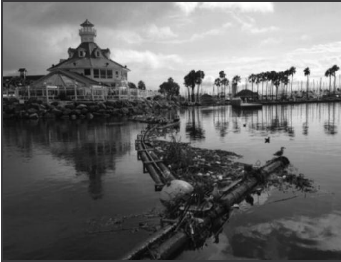
Boom system outside Rainbow Harbor catching water-borne debris following recent rains, prior to material reaching basin.

The Marine Bureau's Beach Maintenance team is waging an on-going fight against the forces of the Los Angeles River and the water-borne debris materials which flow into Long Beach's waterways. Using a combination of pro-active and responsive efforts, the team makes substantial impacts in maintaining a safe and clean marine environment for Long Beach Marinas and Beaches. These efforts include: strategically deployed boom systems designed to catch debris prior to materials reaching the City waterways; use of a specially equipped vessel outfitted for large volume debris removal; and daily 'hand-net' collection efforts from small skimmer boats. During the month of September, following the first rains of the season, the Marine Bureau's debris removal vessel, named the "Marauder" collected more than 20,000 pounds of material in and around the Rainbow Harbor and Shoreline Marina areas alone. "The