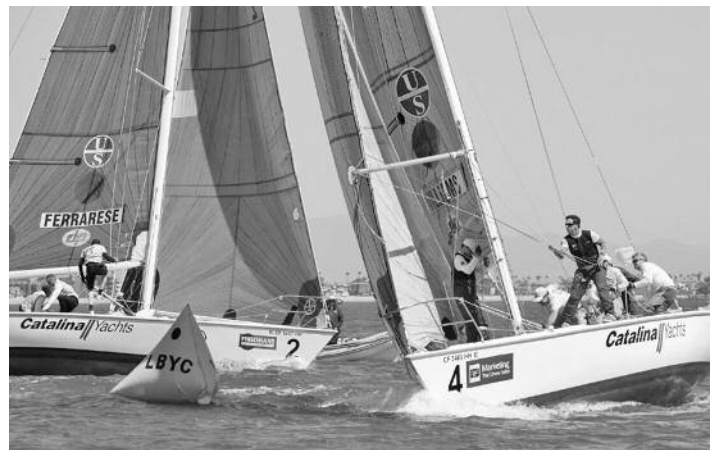
The Congressional Cup returns to Long Beach waters on March 28. The LBYC has hosted this world class event for 53 years.