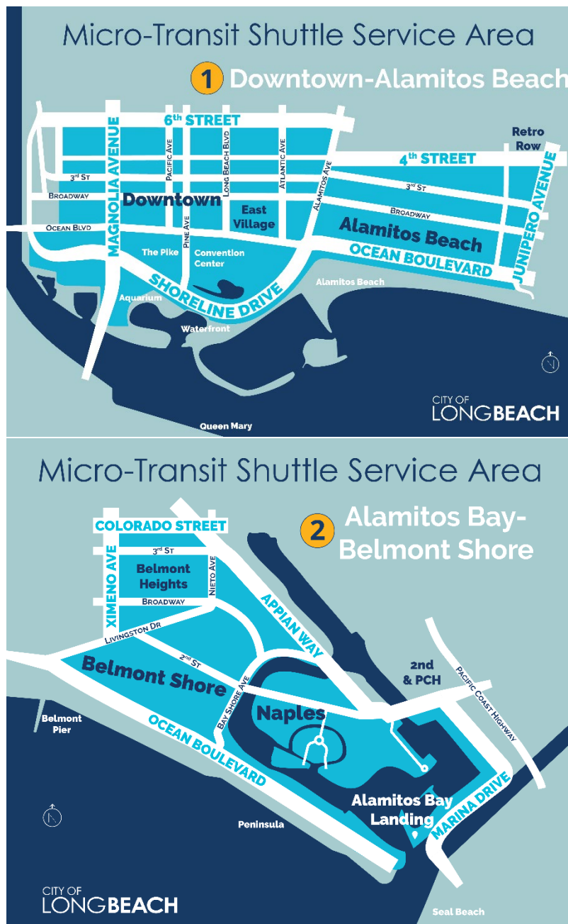
Photo Description: Proposed website graphic indicating the two separate service areas. Service is available within each service area boundary only. There is currently no service between the service areas. For the time being, patrons are encouraged to utilize the City's Bike Share Program, Long Beach Transit or other micro-mobility options for connections between service areas.

On Thursday, November 3, 2022, the City will officially celebrate the launch in the first service area. On Thursday, November 10, 2022, service will be deployed in the Downtown Long Beach-Alamitos Beach service area. The Public Works Department will publish information on their website to outline the shuttle schedules, service area perimeters, instructions on how to use the free micro-transit shuttle service, and more.