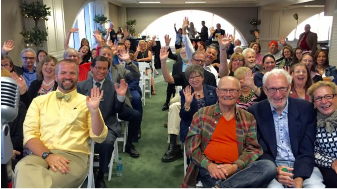
Long Beach Playhouse supporters give our newsletter readers a big wave