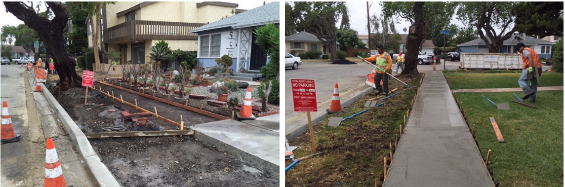
Sidewalk, driveway and curb replacement on Malta