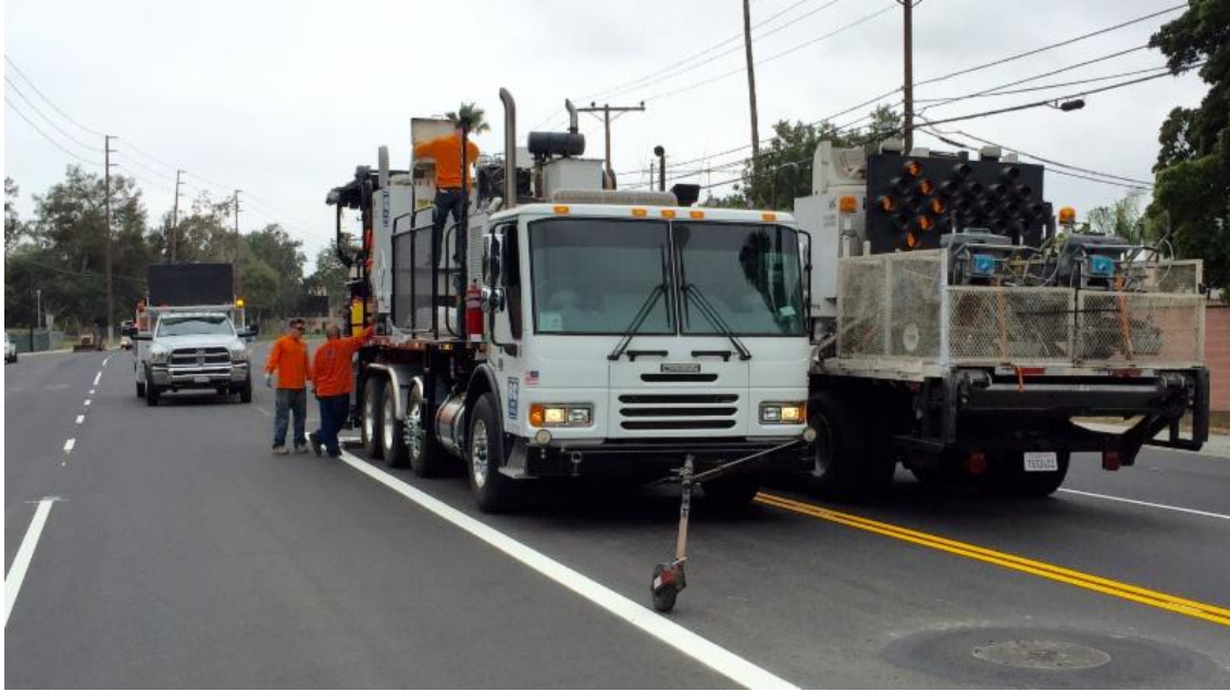
Paint crew completes striping on Atherton Street