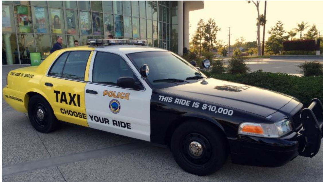
Choose Your Ride: $20 taxi cab or $10,000 police car