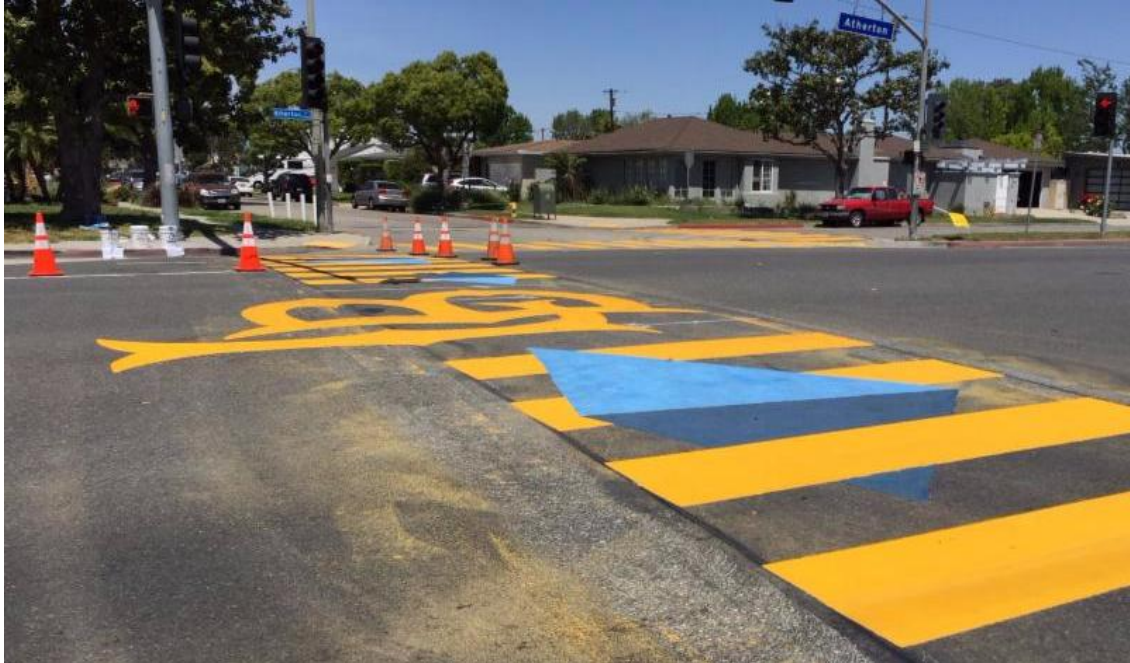
Public Works painted new crosswalks last Saturday for Beach Streets University