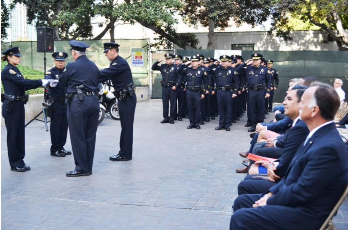
Last year's Police and Fire Memorial outside City Hall