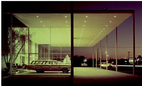
View of showroom at night facing south