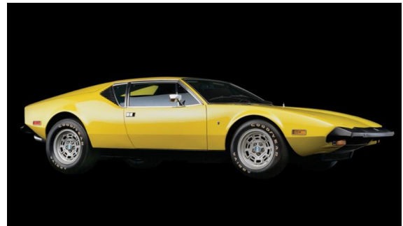
Mid-engine De Tomaso Pantera powered by a Ford 351 (5.8L) Cleveland V8