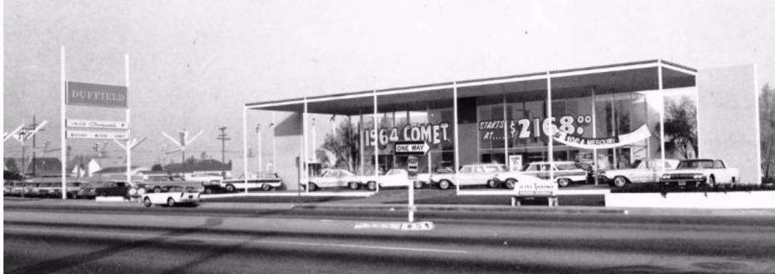
Duffield Lincoln-Mercury at 1940 Lakewood Boulevard at Outer Circle