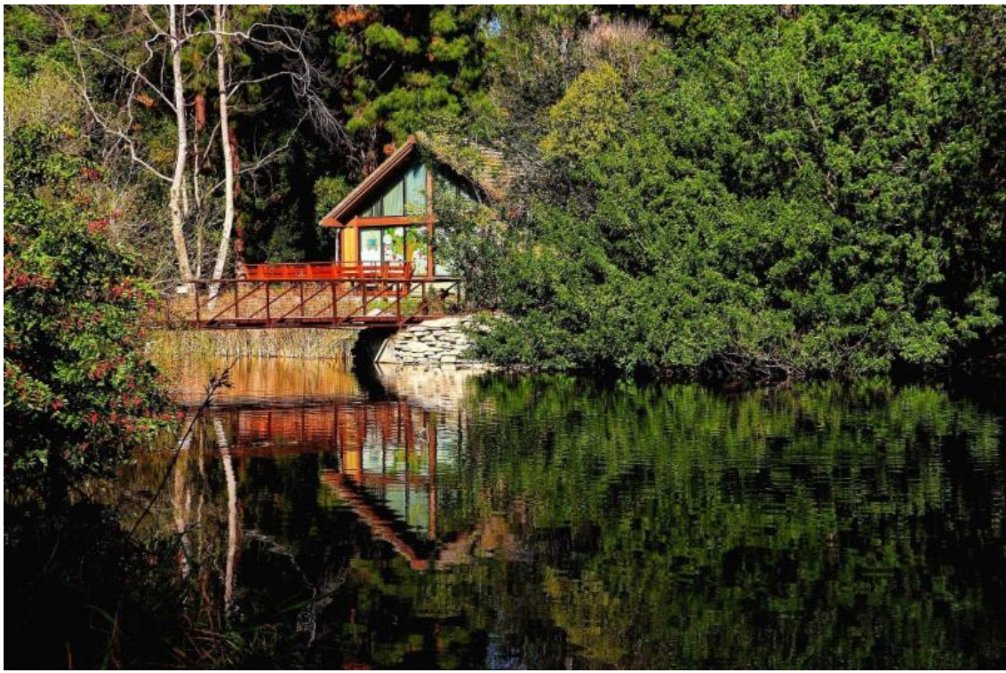
El Dorado Nature Center today