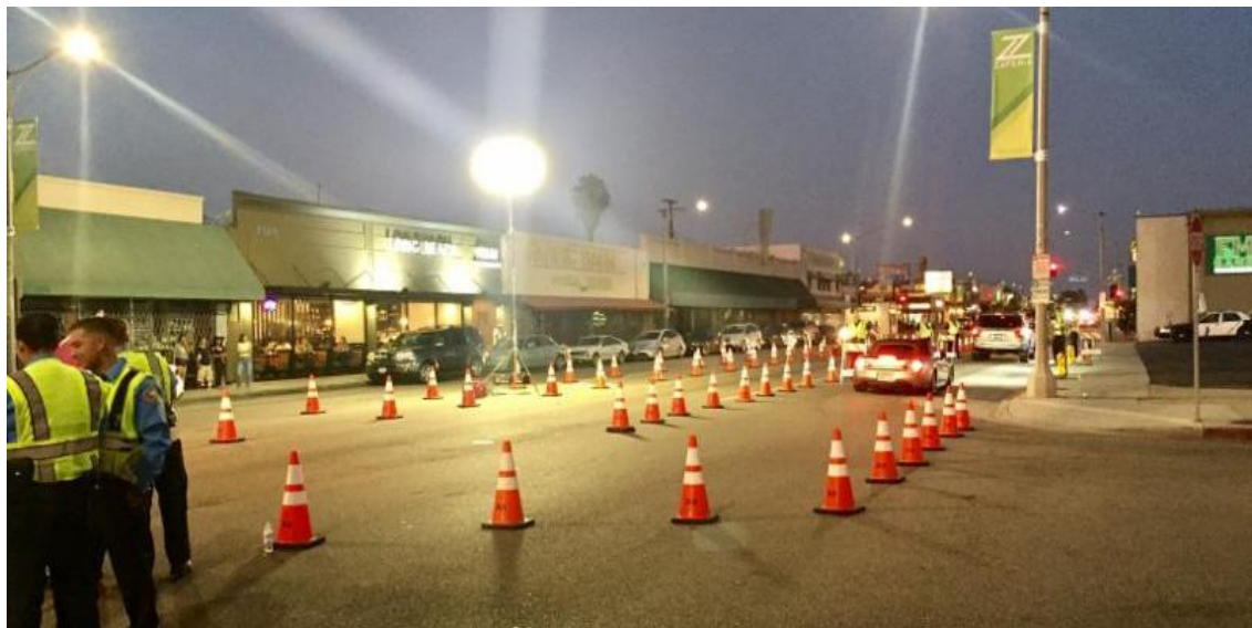
DUI Checkpoint in CD4 at Anaheim and Obispo on August 4th

LBPD is participating in a high-visibility national enforcement campaign, " Drive Sober or Get Pulled Over. " Police and Sheriff's Departments statewide, along with the CHP, will increase the number of officers on the road to stop suspected drunk or drug impaired drivers and motorcyclists. LBPD will have directed enforcement during this 18-day mobilization to enforce all traffic violations by deploying DUI Saturation Patrols on Saturday, August 25 th in the South Division, and Saturday, September 1 st citywide. You can read more about the campaign at this link .