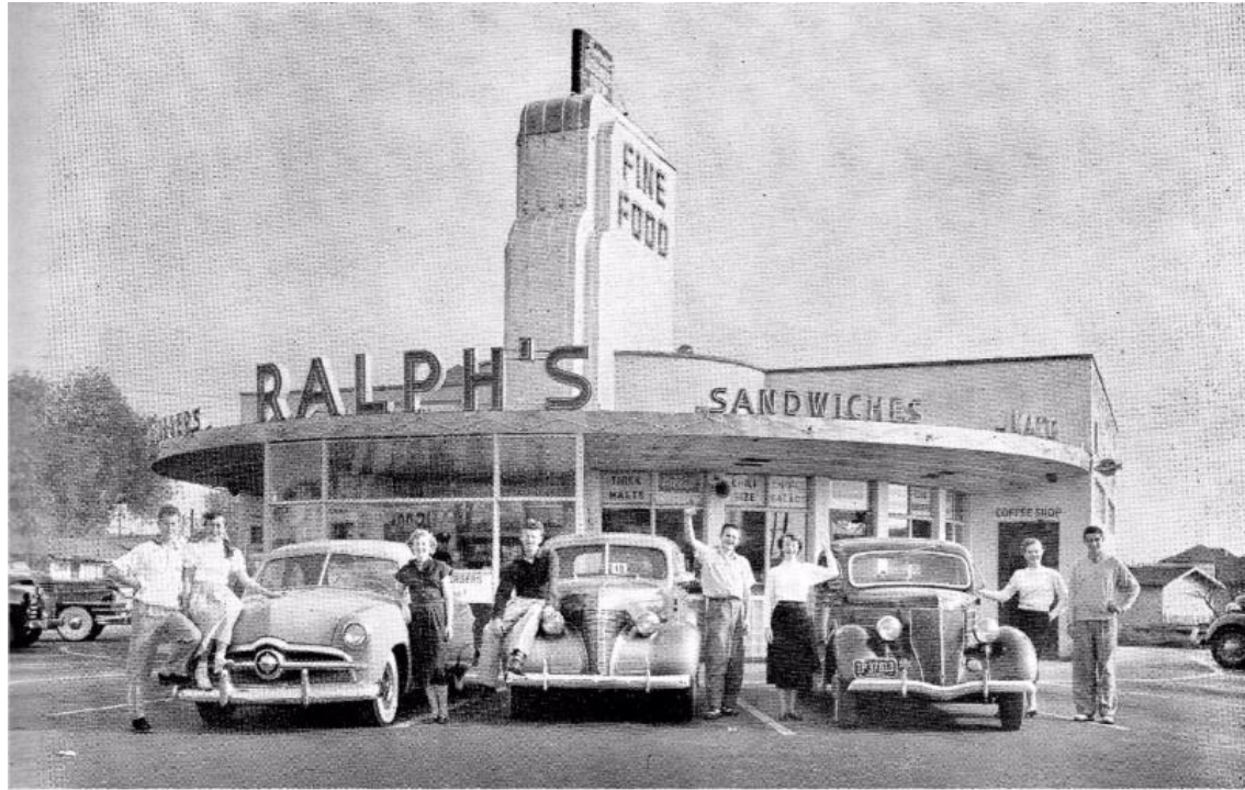
Home of the famous Double Deck Hamburgers

A few weeks ago, we featured the grand re-opening of the Ralphs (no apostrophe) Grocery Store near the traffic circle. The week, we're featuring the Ralph's (with apostrophe) Drive-In that was located on PCH just west of Junipero Ave. The vintage photo/ad below is from the 1951 Wilson High School yearbook. The restaurant was right next to the section of the Pacific Electric Railway right-of-way that was transformed into Rotary Centennial Park in 2005. Although it's no longer a drive-in, there's still a restaurant at 2300 E. PCH where Ralph's once stood.