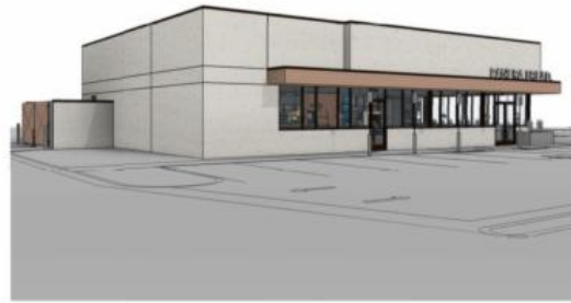
2 | NORTHEAST PERSPECTIVES