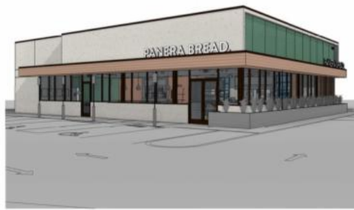
1 | NORTHWEST PERSPECTIVES