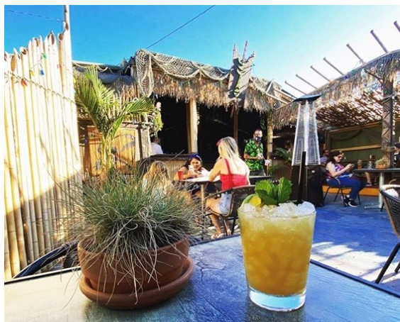
The Bamboo Club, 3522 E. Anaheim St.