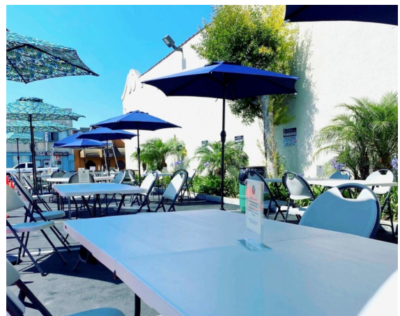
Joe Jost's, 2803 E. Anaheim St.