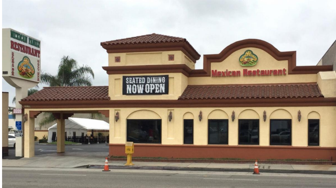
Los Compadres, 3229 E. Anaheim St.