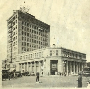
HOME OFFICE, THIRD AND PINE

Long Beach and Vicinity and State of California