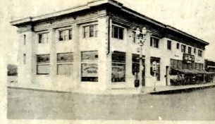
EAST LONG BEACH BRANCH The Pioneer Bank of East Long Beach ANAHEIM AND OBISPO