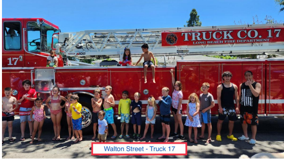
Walton Street - Truck 17