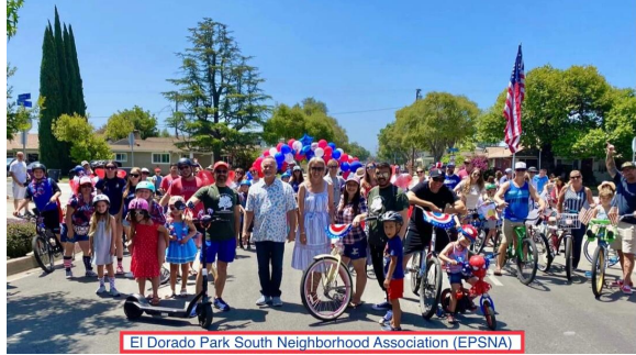
El Dorado Park South Neighborhood Association (EPSNA)