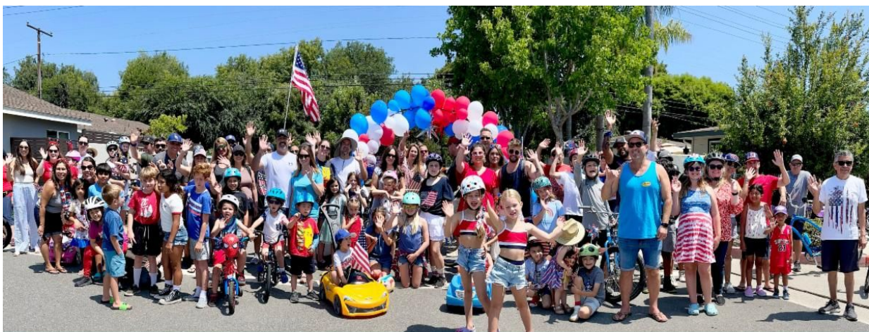
El Dorado Park South