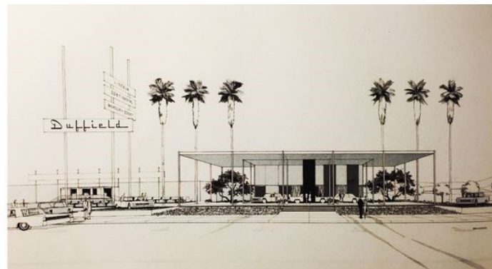
Architectural rendering of Duffield Lincoln-Mercury as it appeared in the Press-Telegram on October 21, 1962.