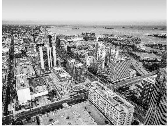
Aerial view of the Long Beach Civic Center in Downtown Long Beach.

The City of Long Beach supports large and small industries through a holistic approach to economic development. All employees, regardless of their position descriptions, are, at their core, economic development ambassadors and are expected to provide excellent customer service. This provides the foundation for a strong, welcoming, and well-run city. In addition, the City supports targeted programs that impact businesses. These programs include workforce development services provided by Pacific Gateway, a City-operated non-profit organization; business improvement districts; streamlined permitting, inspection, and licensing services; low costs business license tax structure; and direct financial assistance through several loan and rebate programs.