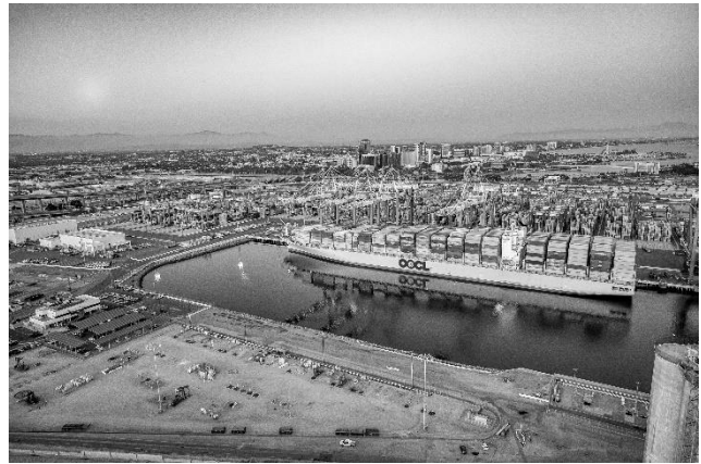
The Port of Long Beach Middle Harbor Terminal.

Currently, the largest employer within the City is the Long Beach Unified School District, which operates 85 regular, one continuation and two charter schools. The District's workforce ensures the success of students by maintaining high standards, a commitment to excellence and by offering a comprehensive scholastic program.