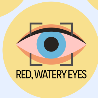
RED, WATERY EYES