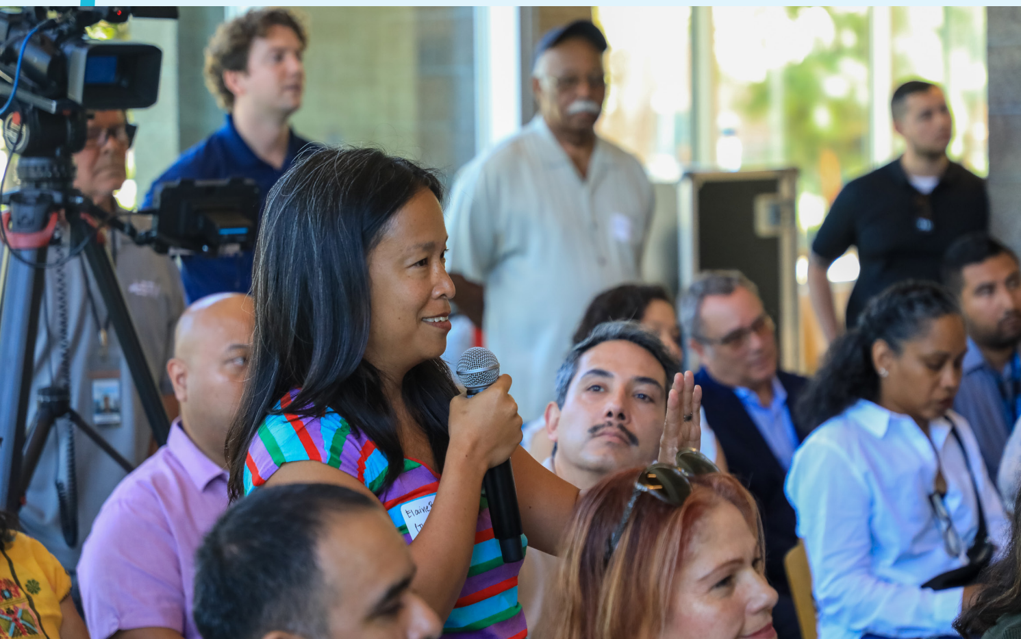
Community members provide critical input about their vision for the future of West Long Beach.

And the important work has already begun. For regular updates or to get more involved, residents can visit the Westside Promise website. The site serves as a resource hub to communicate important information to the community and stakeholders about Westside Promise's objectives, community events, and programs that serve the Westside. It also serves as a tool for transparency and engagement and is regularly updated on key program milestones, accomplishments, and positive impacts through community initiatives, park and street improvements, special events, and area studies.