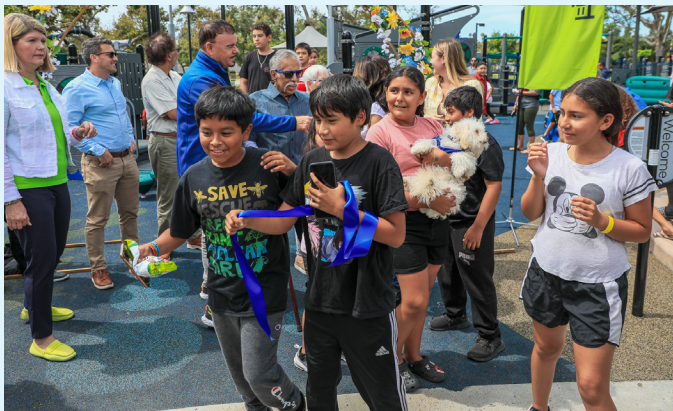
West Long Beach kids enjoying their community parks.

With this focus on collaboration and strategic investments, the City of Long Beach is setting a precedent for community empowerment and revitalization. Westside Promise is not just a pledge for a better tomorrow—it's the blueprint for a decade of growth and prosperity for West Long Beach.