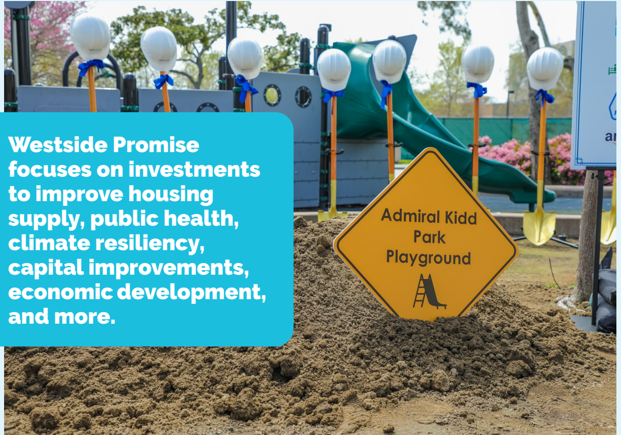
Hard hats and shovels at the new Admiral Kidd Park Playground groundbreaking.

Westside Promise focuses on investments to improve housing supply, public health, climate resiliency, capital improvements, economic development, and more.