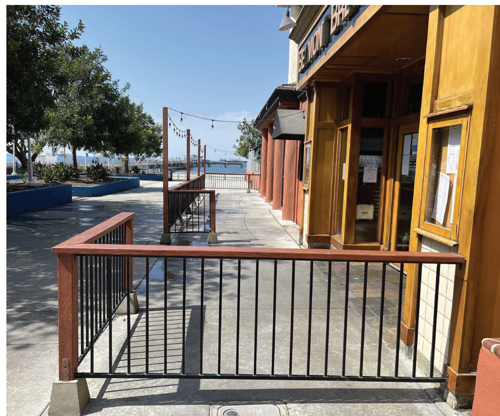
DINING PATIO FACING SOUTH