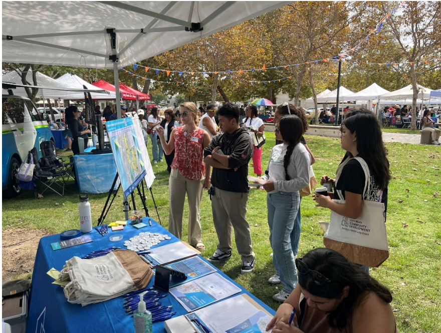
RRM Team Member Explaining the Interactive Map Board to Community Members.