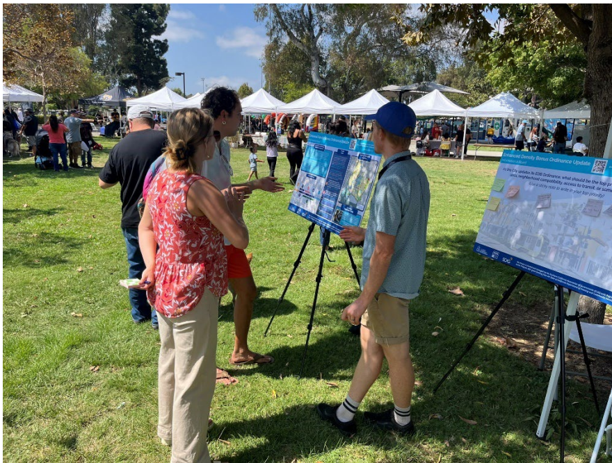
Community Member Asking Questions While Reading the Informational Board.