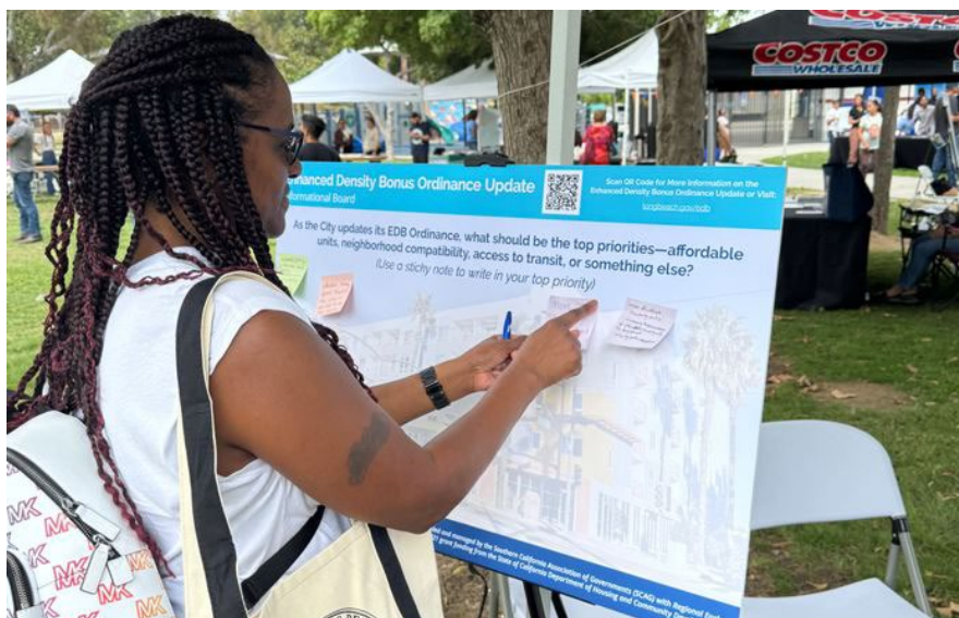
Community Member Placing Response on Interactive Question Board.

In addition to the display boards, the booth featured flyers for Community Workshop #1 to help generate interest in the upcoming event. A summary of the informational board was also provided as a handout for attendees to take with them.