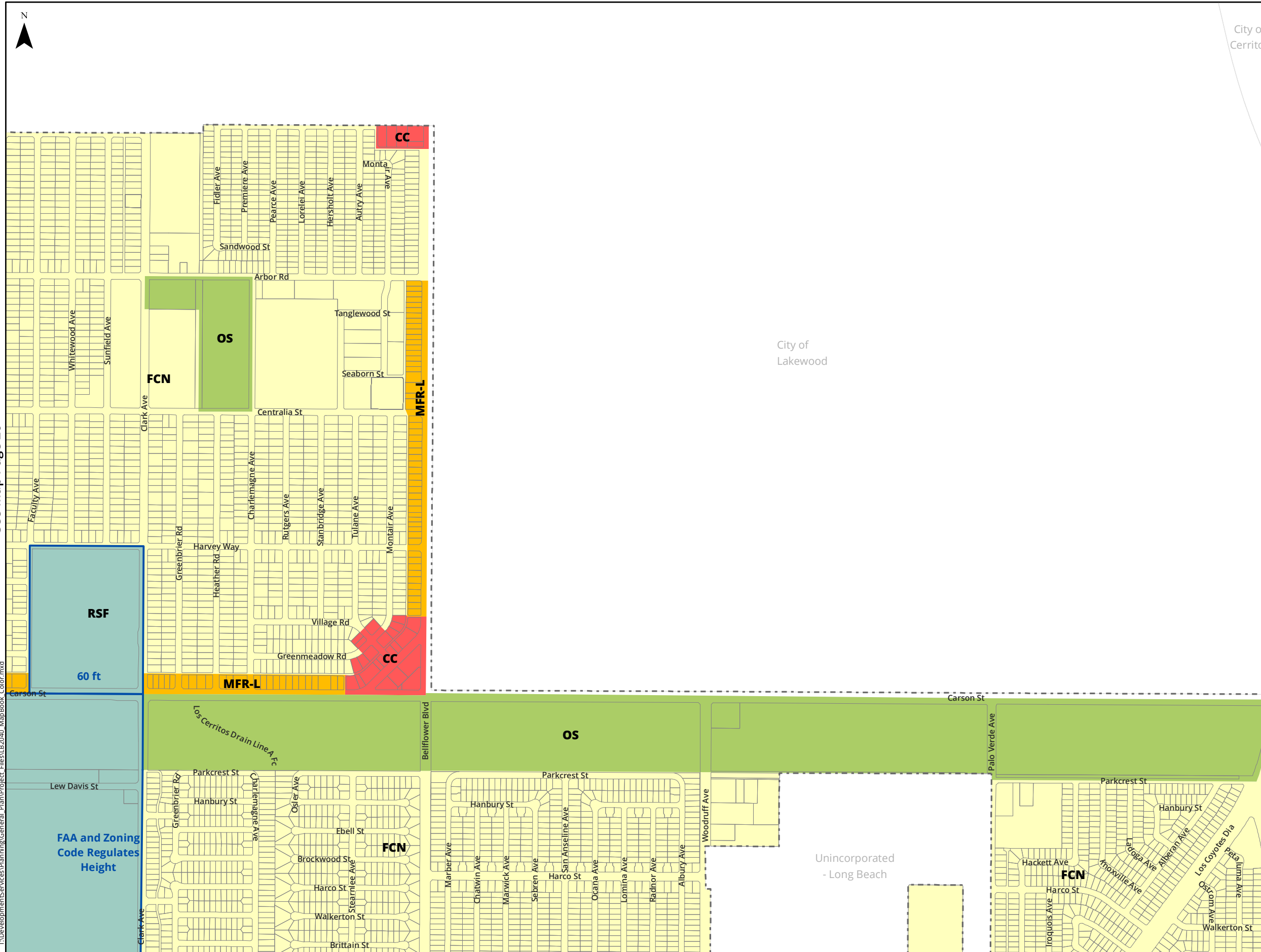
Map Page 27