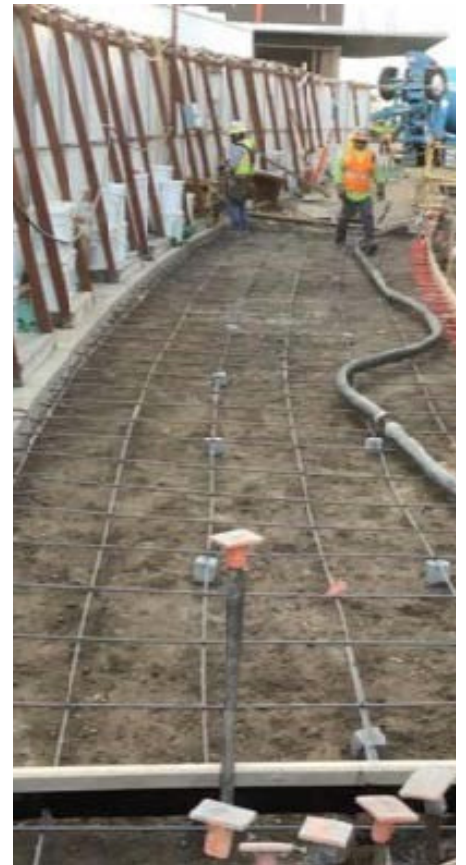
Overhead infrastructure work, framing, and concrete placement are taking place in and around the Historic Terminal.