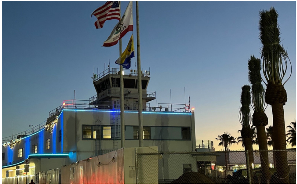
New palm trees have been planted.

You may have noticed three new palm trees have been planted near the flag poles and adjacent to the new baggage service offices and new concessions space. Out of public view, concrete placement in the Plaza area, door framing, preparations for plaster work, and overhead mechanical, electrical and plumbing work inside the Historic Terminal continue to move forward.