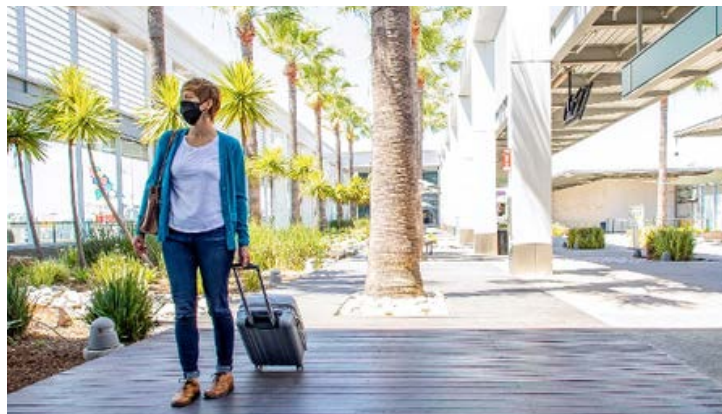
LGB was one of the first airports in the country to build a large outdoor space within a modern concourse.

We are fortunate that LGB's award-winning concourse continues to attract accolades, especially as it relates to passenger concerns about health and safety during the pandemic. Please feel free to share these positive stories with your networks!