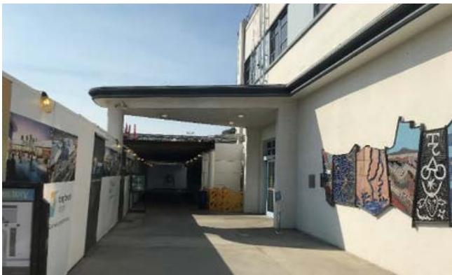
The porte-cochère is visible once again.