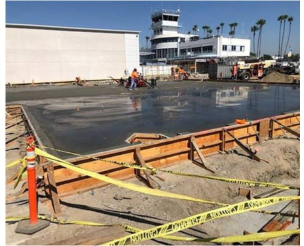
The concrete placement slab on grade for the CBIS building was completed last month.

Demolition of the breezeway south of the terminal unveiled a glimpse of the past. For the first time in many years, the porte-cochère on the south side of our historic 1941 terminal is now fully visible again! Vehicles previously passed through this structure to drop off passengers. You can spot the porte-cochère in this black and white photo of the terminal circa 1963.