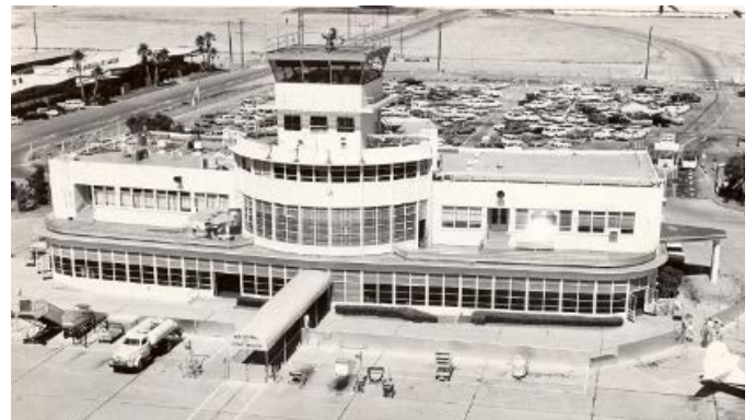
Long Beach Airport terminal circa 1963.