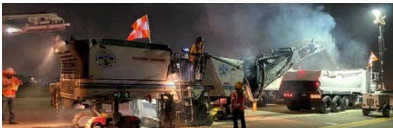
Once removed, the material is hauled away to be recycled.

We've started our Taxiway D Improvement Project that will enhance airfield safety. So far, approximately 16,000 sq. yards of existing asphalt concrete pavement has been removed. The milling operations will result in recycled asphalt that can be used on other projects. Recycling of existing material on site saves money and time and is environmentally friendly.