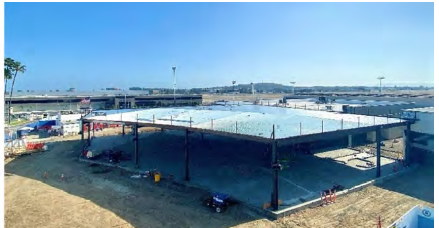
Raising the roof on the new Ticketing Lobby