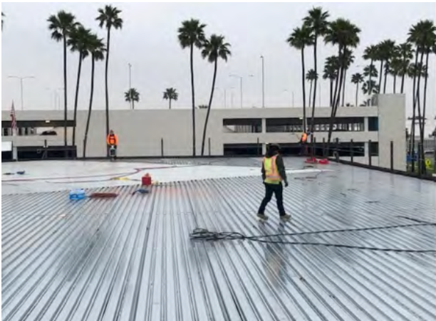
Ticketing's roof decking installation

We reached another milestone with the construction of our new Ticketing Lobby as part of our Phase II Terminal Improvement Program. The new steel roof decking installation has been completed and it looks great! Focus now turns to electrical and mechanical infrastructure. With the exterior construction of the new Consolidated Baggage Inspection System (CBIS) building complete, we're concentrating on interior elements. Installation of electrical and information technology conduits, security and fire alarm systems and the baggage handling conveyor continues to move forward, in preparation for delivery of new screening machines and associated equipment. Phase II is really taking off - enjoy this time-lapse video to see its impressive progress!