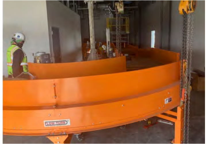
CBIS Baggage Handling System (BHS) installation

We're making significant progress with our Taxiway B Improvement Project. Last month, pavement of a large portion of Taxilane E1 and a new perimeter road, between the former Taxiway B and the new Taxiway E, was completed. We also moved forward with the first of two coats of airfield striping, installation of airfield lighting and signage, and placement of hydroseed. Subsequently, the intersection of Taxiway J is expected to be closed for approximately one month while the Taxilane E1 tie-in work and final striping is completed.