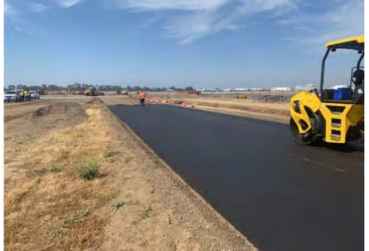
The new perimeter road is paved