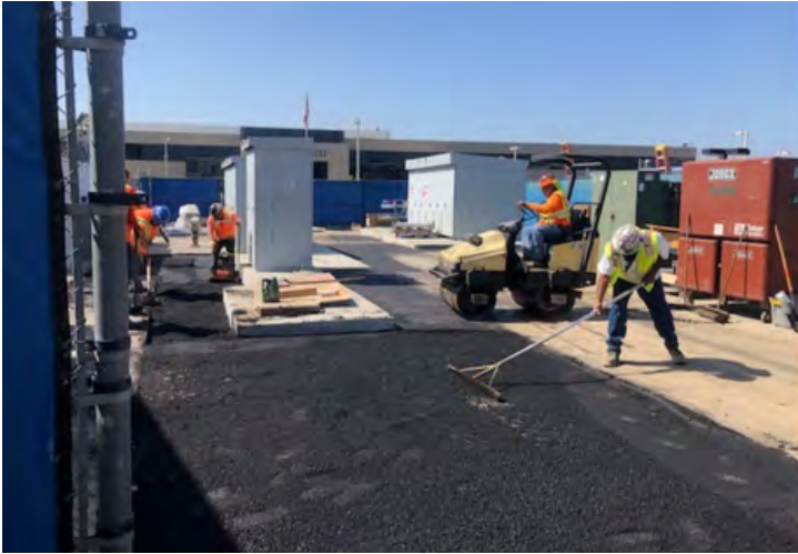
Pavement placement underway