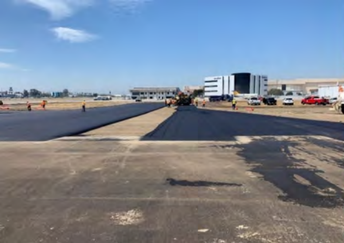
Paving future Taxilane E

We're making significant progress with our Taxiway B Improvement Project. Last month, pavement of a large portion of Taxilane E1 and a new perimeter road, between the former Taxiway B and the new Taxiway E, was completed. We also moved forward with the first of two coats of airfield striping, installation of airfield lighting and signage, and placement of hydroseed. Subsequently, the intersection of Taxiway J is expected to be closed for approximately one month while the Taxilane E1 tie-in work and final striping is completed.