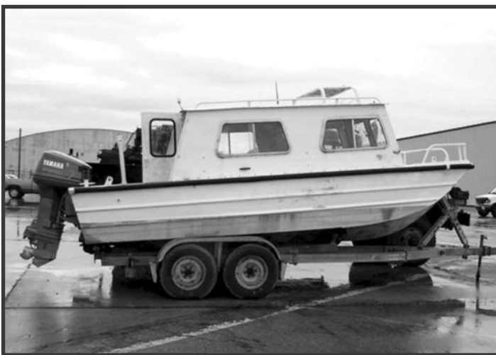
Impounded and abandoned vessels will be up for auction at Alamitos Bay Marina.

For additional auction information you can call Vilma at (562) 570-3215 or e-mail vilma.Hernandez@longbeach.gov