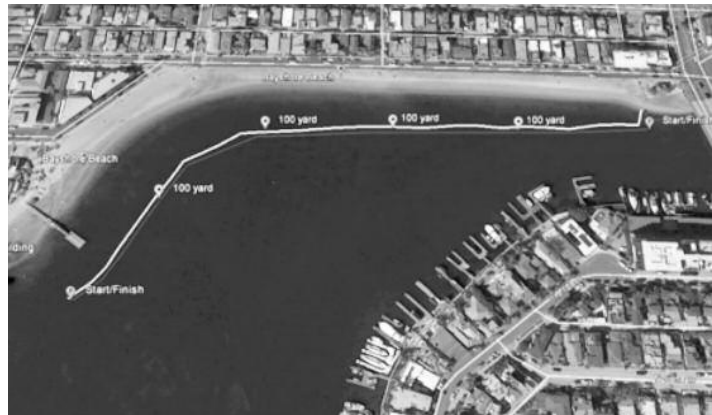
Bayshore Buoy 100 yard Swim Line markers