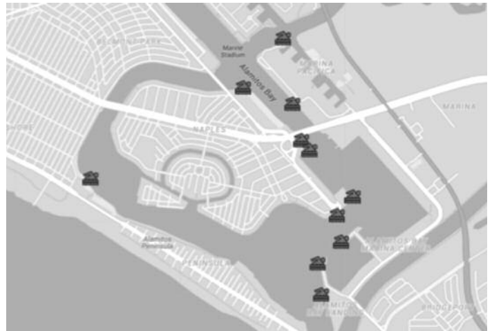
Swim ladder locations, Alamitos Bay