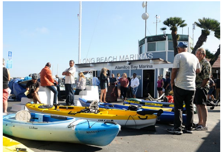
Prospective bidders check out the items on offer.

The Long Beach Marine Bureau will be holding an auction of impounded and abandoned vessels on November 10th at the Alamitos Bay Marina Office, 205 N. Marina Drive, Long Beach, CA 90803. Inspection and registration begins at 8AM and the bidding begins at 9AM.