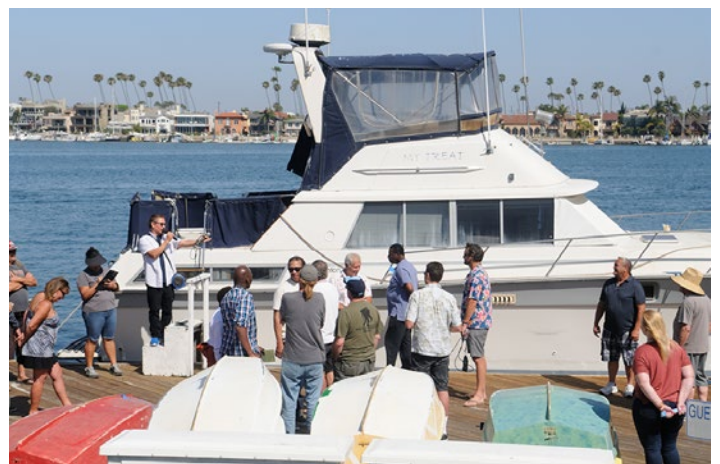
A wide array of vessels are available at the auction.

All items offered "As Is – Where Is." All sales are final. There will be no refunds or adjustments. There is no warranty either specific or implied as to the condition of the items offered for sale and we reserve the right to reject any offer or withdraw any item from the sale.