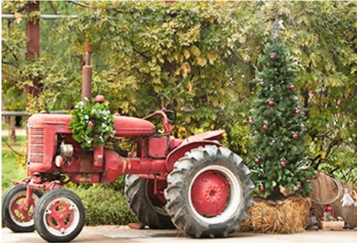
Holiday celebrations take place at Rancho Los Cerritos on December 9th.

Here are some of the events going on in Long Beach this December to put you in the holiday spirit.