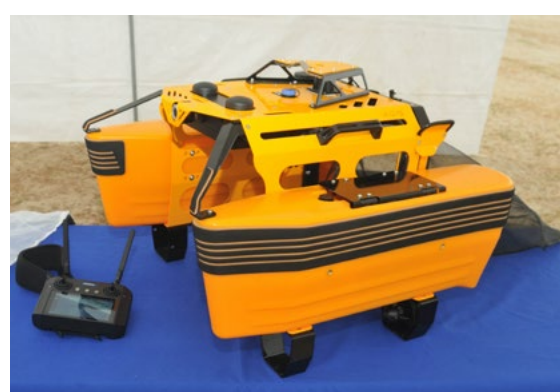
NAME THE JELLYFISHBOT CONTEST FOR YOUTH RUNS UNTIL OCT 25.

the Pacific and supported by sponsors Long Beach Container Terminal and Intex Recreation Corporation, launched a youth art and naming contest for the robot. Local vouth are invited to welcome this cool new critter by sharing ideas for a chance to name