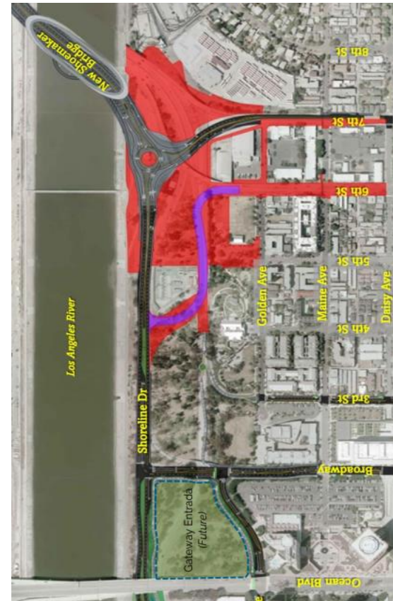
Interim Condition: Demo old Shoemaker Bridge