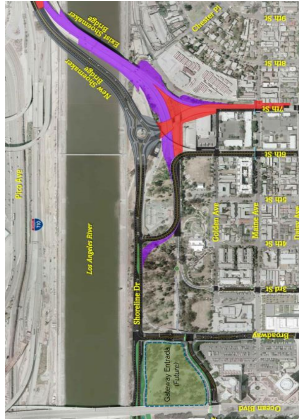
Interim Condition: Partial Shoreline Drive re-alignment New Shoemaker Bridge construction