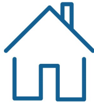
Buildings & Neighborhoods